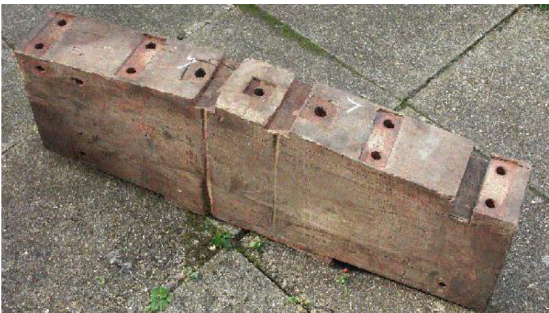
One of the old headstocks

The old headstocks were elm – very good for carving and turning, so we cut up the headstocks and made 92 mementos (in three sizes: 5", 4" and 3" diameter) that were eagerly bought by ringers and congregation.