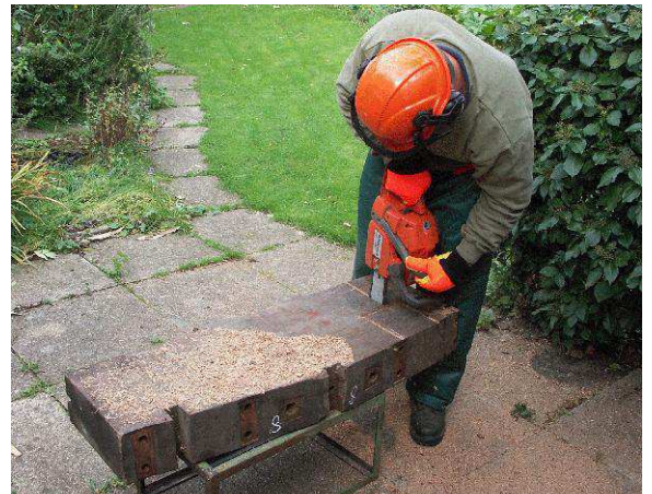
Cutting up with a chain saw