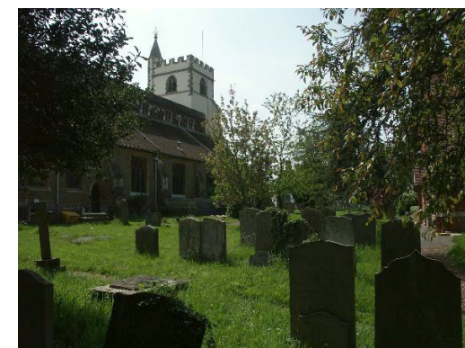
The tower seen from the churchyard