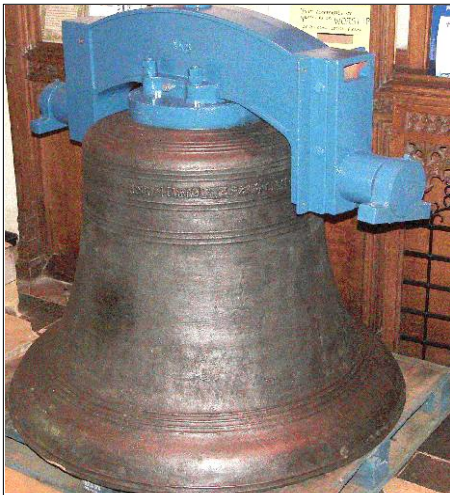
All Saints' oldest bell, cast in 1703, waiting to be lifted up the tower after restoration in 2004. It weighs just over \frac{3}{4} ton, and is nearly 4 feet (1.2m) diameter.

The oldest bells at All Saints have been here for over 300 years. Just imagine how many brides and grooms have walked out into the sunlight after their wedding service, and heard their joyous sound ringing out over the churchyard and the town.