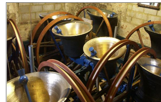
The bells mouth up, ready for ringing

If at a convenient time before (or after) your wedding, you would like to visit the tower to see the bells, and the spectacular views from the roof, we can normally arrange this for you.