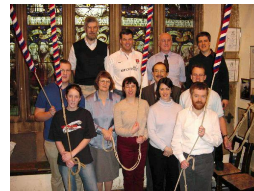
Some of the ringers at All Saints